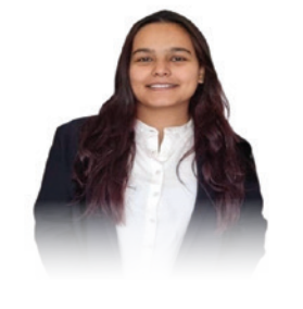
Co-convener & Head of Internal Committee